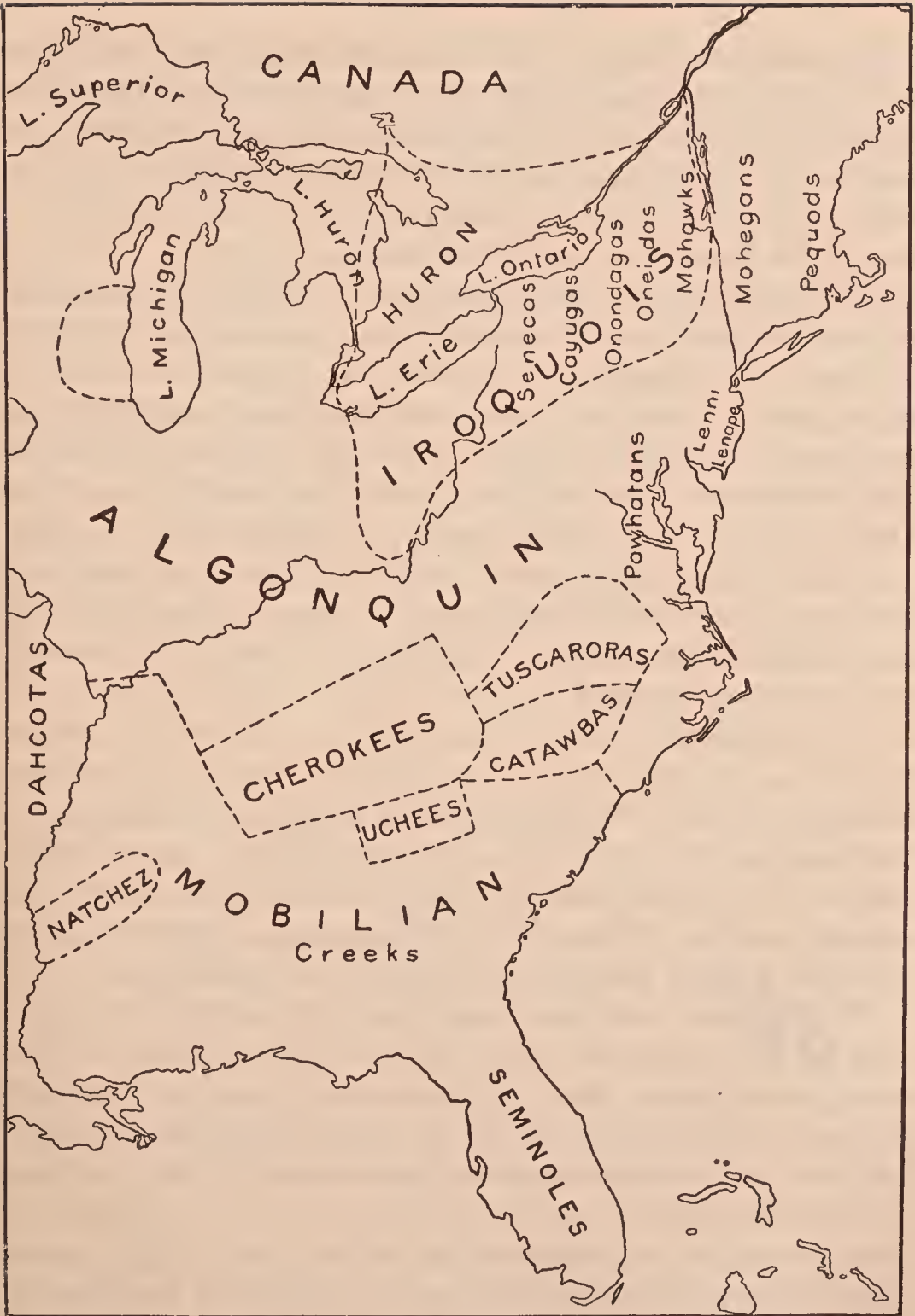
Map Locating Principal Indian Tribes